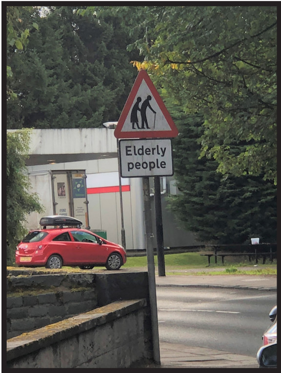
A parking lot sign found in Pitlochry, Scotland. — C.E.