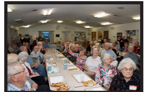
A record number came to VMRC's Village Hall on Sept. 27 for potluck dinner and a detailed presentation on the innovations that "Project 2.0" brings to "Valley Village" — including that new name for the former "Park View Village."