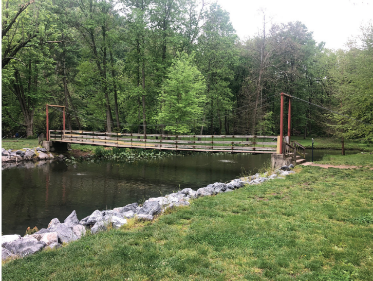
Swinging bridge at Wildwood Park, photo by Lowell Wenger.