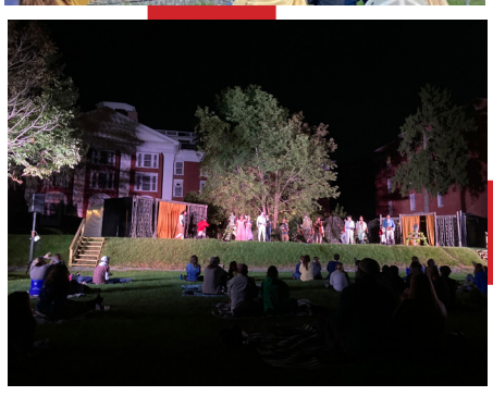
Ten VV members traveled to Staunton to enjoy the year's final outdoor performance of Shakespeare's "Twelfth Night."

Ten Valley Village members attended the American Shakespeare Center's delightful outdoor performance of "Twelfth Night" Saturday, Sept 26, on the spacious, historic grounds of the Blackburn Inn in Staunton. It was the last outdoor performance of the season, and the moon and stars added a special touch!